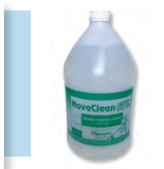
NovaClean® AFX Amine free formulation NC10-G