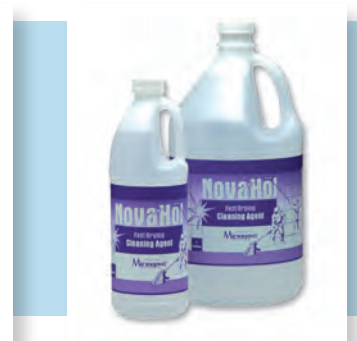
NovaHol® Ready to Use quick drying formula with IPA NH1-G, NH1-Q