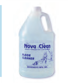
NovaClean® Concentrated multi surface detergent NC1-G