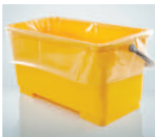
LDPE/Nylon laminate Bucket Liner in Slim T™ bucket