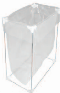
LDPE BinLiner in Stainless Steel BinLiner Stand