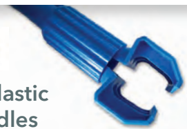
Full Length Plastic Adapter Handles