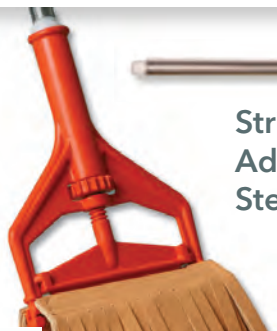
String Mop Frame Adapter and Stainless Steel Handle

Flat Polyester/cellulose blend strand mop for added absorbency in cleaning. Single use.