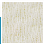
PolySorb™ Textured Polyester