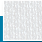
NovaPoly™ Smooth Polyester