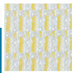
PolyMesh™ Braided Mesh over Polyester