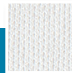
MegaTex™ Textured Polyamide