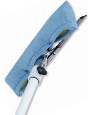
Microfiber Thick Slim T™ Mop Cover on Window Washing Tool