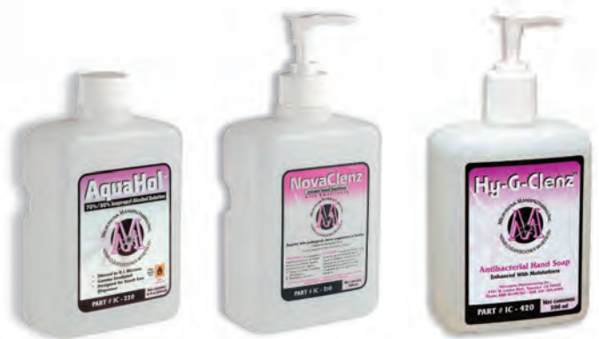
AquaHol™ Sterile Alcohol Sanitizer IC-220