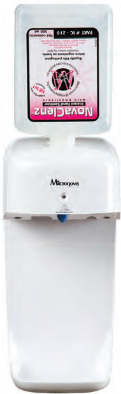
Touch Free MicroDispenser™ ICDISP-3

The act of removing viruses/bacteria or other unwanted substance from your hands is simple with Micronova's soaps and sanitizers