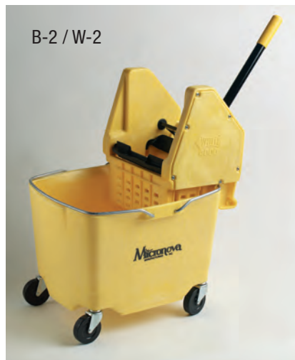
B-2 / W-2

See Pages 10 and 11 for More Buckets and Wringers