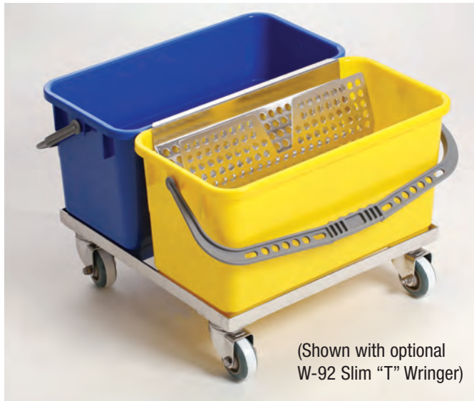
(Shown with optional W-92 Slim "T" Wringer)