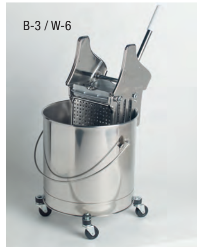
B-3 / W-6