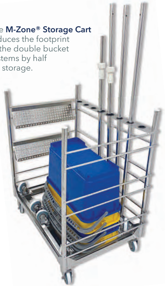
Mop Handle Cart

The M-Zone® Storage Cart reduces the footprint of the double bucket systems by half for storage.