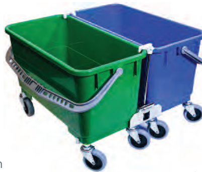
BB-TR-DBREYE shown with W-9 wringer and SnapMop™

The BucketBinder™ Multi Bucket System is a cost efficient, ergonomic and simple multi bucket system