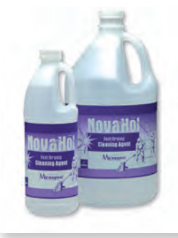
NovaHol ® Ready to Use quick drying formula with IPA NH1-G, NH1-Q