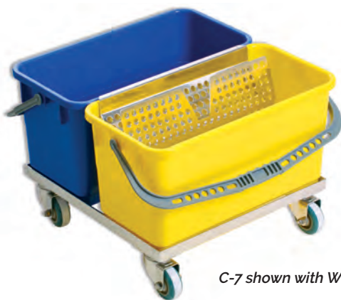
C-7 shown with W-92 wringer

All Multi Bucket Systems are Autoclavable