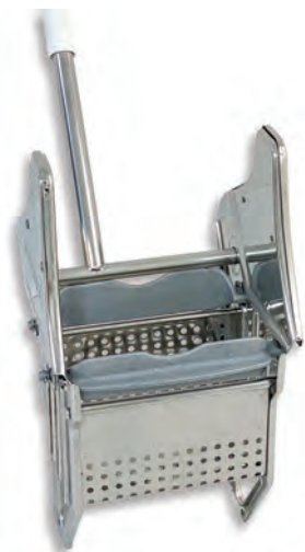
W-6 Downpress wringer, stainless steel