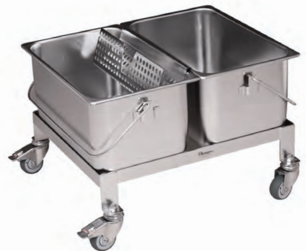
C-92 cart includes two B-99 buckets. Shown with W-92 Wringer