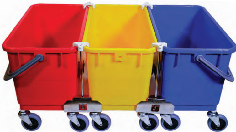
The kit includes two or three polypropylene buckets with casters and one or two sets of BucketBinders (bucket connectors).

Available with 6-gallon molded polypropylene or 8-gallon molded stainless steel buckets. Stainless Steel system includes brake feature.