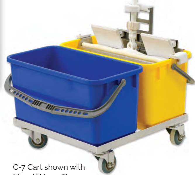
C-7 Cart shown with MegaWringer™