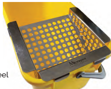
W-9B BoxWringer, sieve style for Slim T Bucket