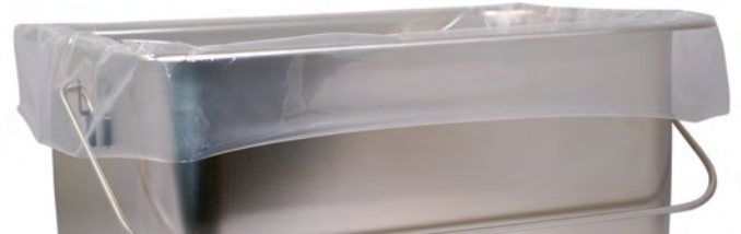
BKL99-3512IR for B-99 buckets

The BucketLiner™, with a unique LDPE/Nylon laminate, is an ideal impermeable barrier material for lining totes to transport product parts, raw materials or to line buckets containing disinfectants or other cleaning solutions.