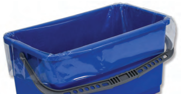
BKL7-3119IR for Slim T™ buckets