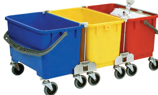
BB-TR-DBREYE shown with W-9 wringer and SnapMop™