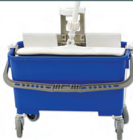
B-7DBAC shown with W-94 wringer and SnapMop™

All Single Bucket Systems are Autoclavable