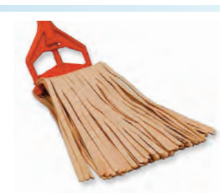
NovaLite<sup>™</sup> MicroMop<sup>™</sup> An absorbent synthetic chamois flat strand mop

PolyVinyl Alcohol non-woven mop with an absorbency of 600% and drying time of 10-12 seconds.