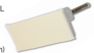
(Above) NovaPoly Pad

Thick Pad, Scrub Pad 1 in (2.5 cm) Standard 1/2 in (1.3 cm) SlipCover 1/8 in (0.3cm) Adapter 1/4 in (0.8 cm)