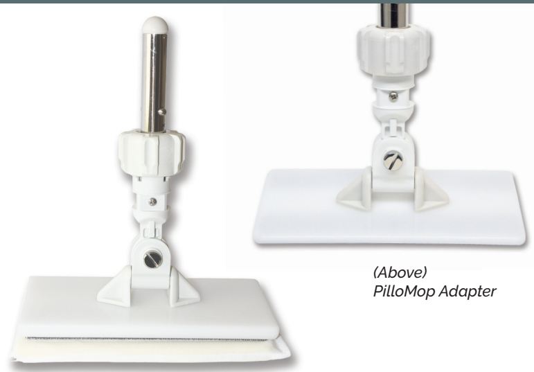
(Above) PilloMop Adapter

The PilloMop™ is a smooth polyester over foam mop head that attaches to the PilloMop adapter via polyester hook and loop strips. The 360° swivel adapter makes it easier to reach awkward corners and angles, ideal for cleaning shelving and narrow chambers. The PilloMop is available in two thicknesses ½" and 1". Single-ply polyester covers are also available, without foam, to be used as a slipcover over a PilloMop or by themselves.