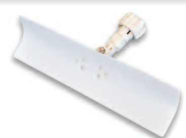
Cove N Curve™ Maleable to match wall coving or piping curves