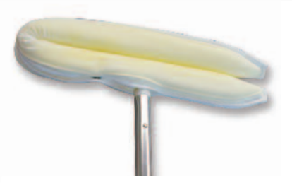
Econo Curtain Cleaner™ Slides down both sides of strip curtains simultaneously

Clean and reduce residual liquids on soft walls, windows, ceilings and floors.