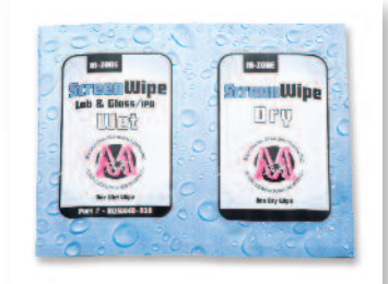
ScreenWipes Clean and dry delicate screens, tablets and

Available as a concentrate or in ready to use Lab & Glass Cleaner™, the fast drying Novahol®, with added IPA, or M-Zone® Screen Wipes, presaturated with a blend of NovaClean and IPA.