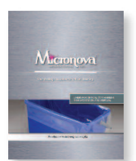
Click for Liners